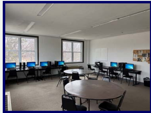
Pictured below is the Community Center Computer Room